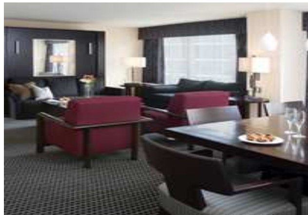
Doubletree Hotel – Magnificent Mile